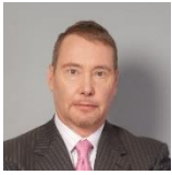
Jeffrey Gundlach Portfolio Manager CEO & CIO