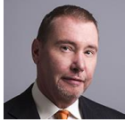
Jeffrey Gundlach CEO & CIO